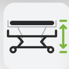
Height 240 – 800 mm