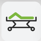
Leg rest 0 – 35°