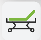
Back rest 0 – 70°

The “all-in-one care bed” combines all the requirements of a modern care bed in terms of comfort and ergonomics, and comes with a range of stylish designs. The Seracare is particularly suitable for use in care homes.